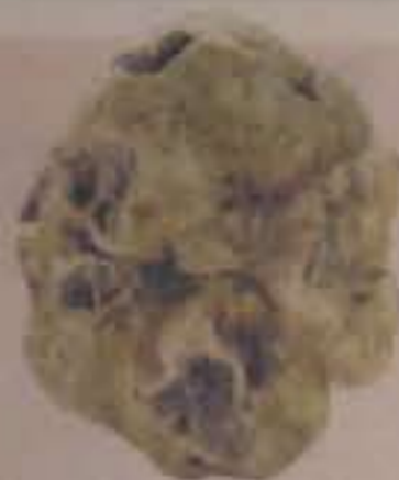
▲ London Fine Foods Alba truffle, 50g approx £500 londonfinefoods.co.uk

From keeping track of time to killing it, literally. Take a trip to London gun and rifle makers William & Son. The