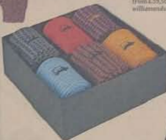
▲ London Sock Company, from £11 londonsockcompany.com