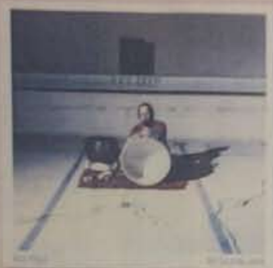
▲ Bill Viola's 'The Talking Drum', £300, vinylfactory.com