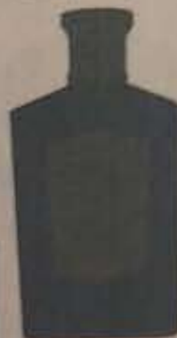
▲ Floris bespoke full fragrance design, £4,000 floris.com