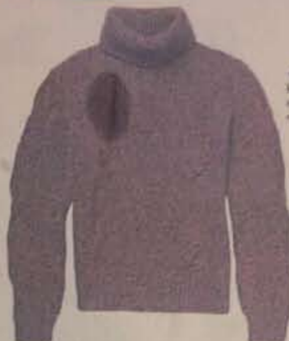
▲ Berluti cable-knit cashmere sweater, £1,200 www.berluti.com