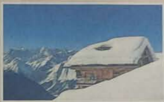
▲ Nyumbia la Verbeke, £24,000 (for seven nights including gourmet catering) www.nyumbiala.com