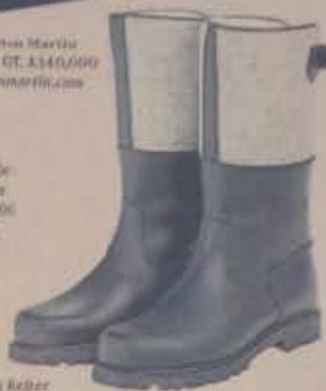
▲ Ludwig Reiter leather winter boots, £591 ludwig-reiter.com