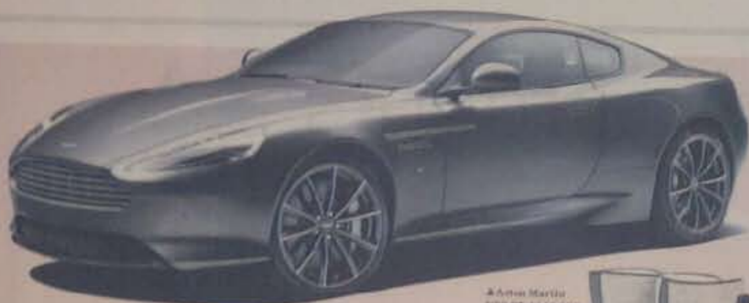
▲ Aston Martin DB9 GT, £140,000 www.astonmartin.com