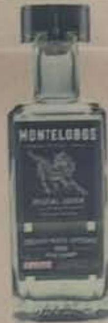
▲ Montelobos organic mineral, £44.95 theshopbycheff.com