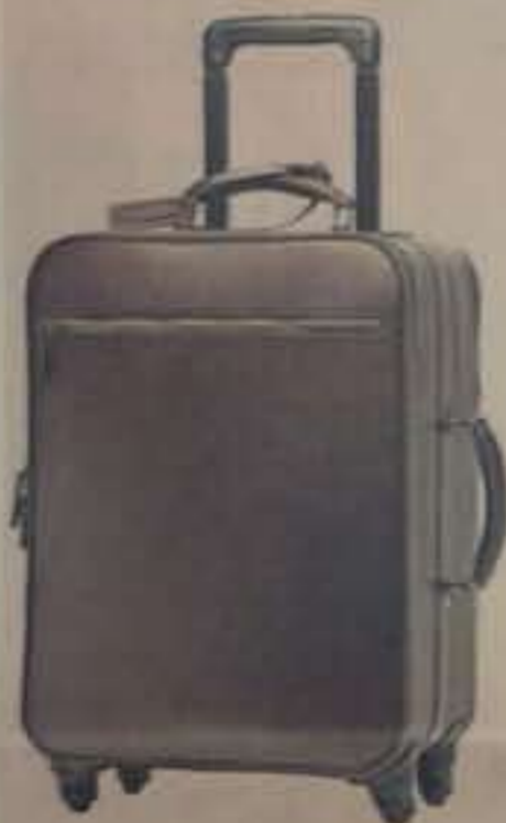
▲ Tommaso Casinelli cowhide stowaway case, £3,010 tommasocasinelli.com