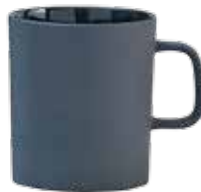
FROM FAR LEFT Axor One thermostat; Olio tableware for Royal Doulton; 2012 Olympic Torch.