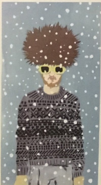
Calvin Klein Collection