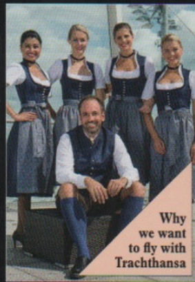
Why we want to fly with Trachthansa

How the humble house plant went wild and the pot hotshots after your terrace, patio and more