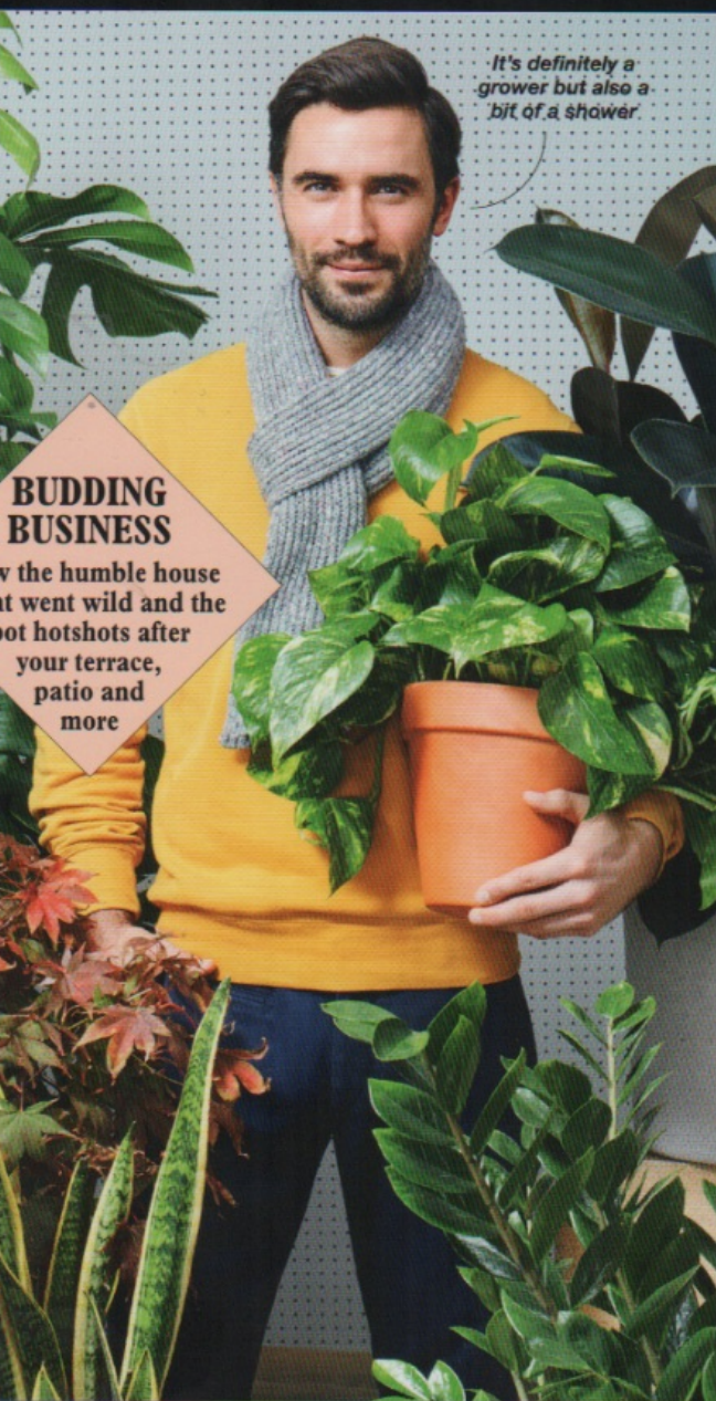
It's definitely a grower but also a bit of a shower.